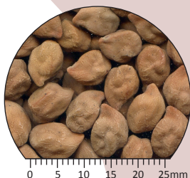
PBA HatTrick ®