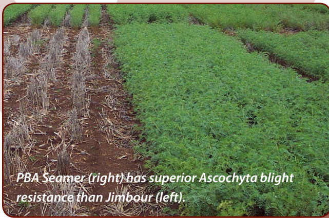
PBA Seamer (right) has superior Ascochyta blight resistance than Jimbour (left).