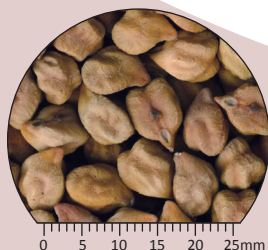
PBA Seamer ®